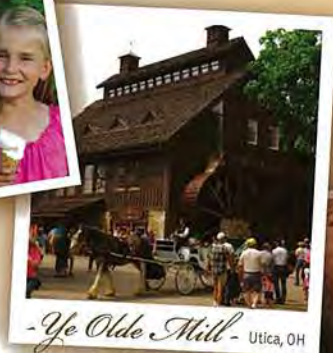
Ye Olde Mill - Utica, OH