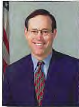
Bob Taft, Governor State of Ohio

We are blessed to live in a state where agriculture is such a large part of our heritage and such an important part of our future. On behalf of all Ohioans, I thank the inductees for their commitment to advancing agriculture in Ohio.